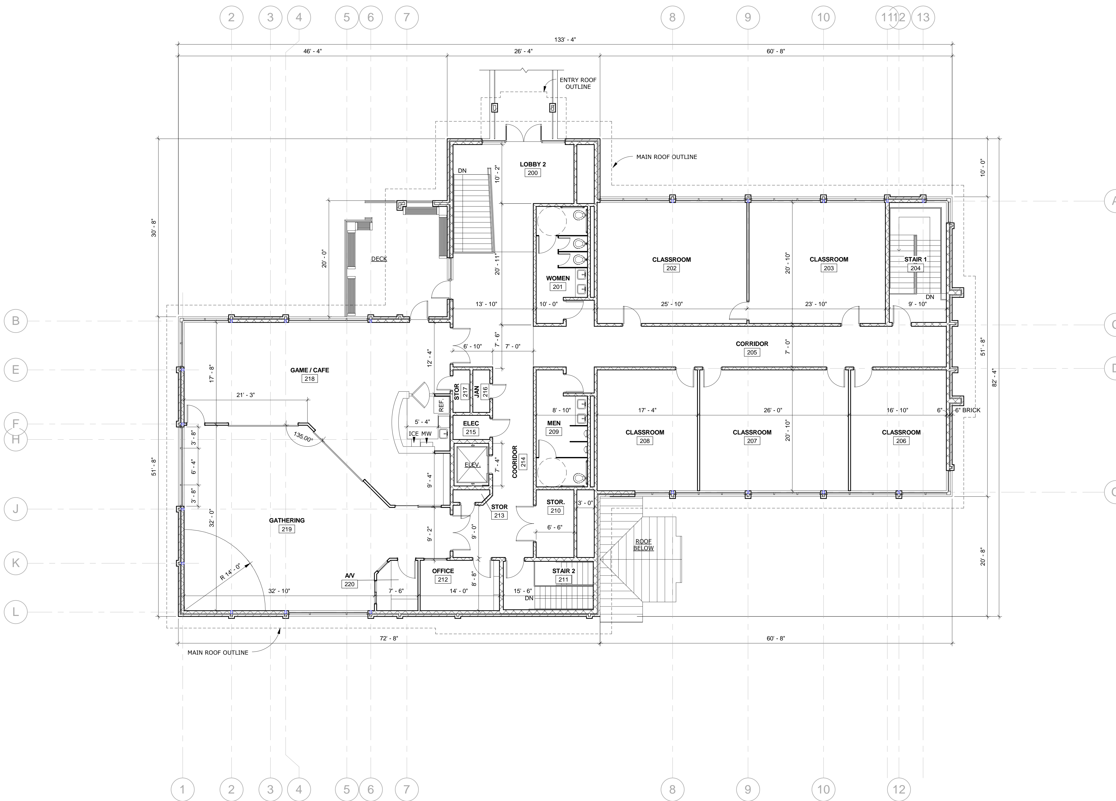
D1 SECOND FLOOR PLAN A401/A102 SCALE: 1/8" = 1'-0" 0 2' 4' 8' 16'